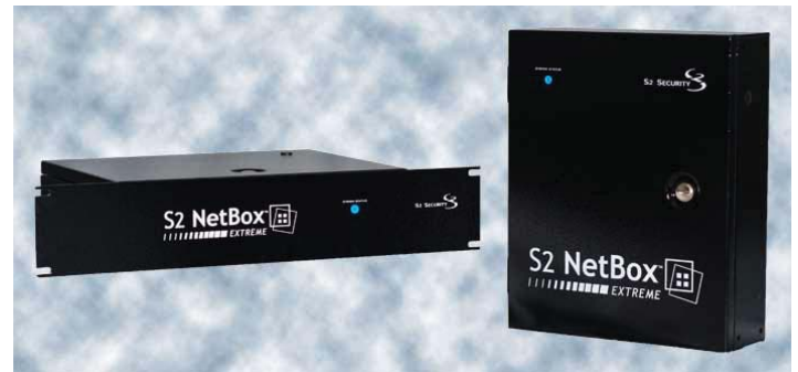
S2 NetBox Extreme is offered in a compact wall mount enclosure or a 2U rack mount.

Two storage options are available for the S2 NetBox Extreme : the standard 8GB SSD is ideal for most applications where historical data is periodically archived. In cases where it is desirable to keep a deep archive of historical data on the system, the optional 64 GB SSD can be ordered. Two mounting solutions are available: the standard wall mount and the 2U rack mount.